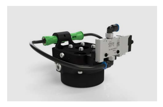
Benefits of 3D printing the main body of the Foam Gripper against using traditional fabrication methods.

"Cobots have limitations on pay loads, generally somewhere between 2 - 6kg. The benefit of 3D printed end of arm tooling is that those 3D printed components are extremely lightweight, which means the productivity of a robot can be substantially increased. A huge advantage."