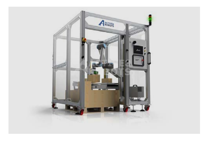
Mobile Palletising Cell using an adaptation of the Foam Gripper